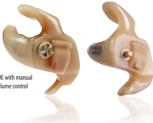
COE with manual volume control