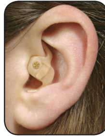
The COE provides a comfortable open-ear fit.